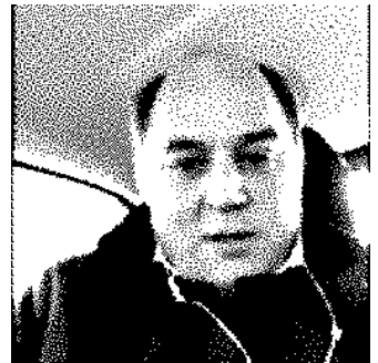
Src: CoffeeSpace 28 .

I wrote a great article on Going Green 27 , where I re-processed the statistics of New Zealand's greenhouse gas emissions and show that they are unfairly burdening the working class.