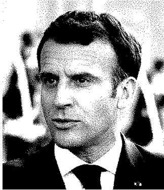
Src: Wikipedia Commons 25 .

still in Macron's favour, but increasingly less.