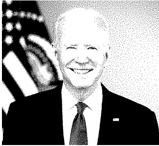
Src: Wikipedia Commons 23 .

rolling out Obama and offering to postpone student debt loans to boost approval 21 . Bare in mind, he already made the promise during the 2020 election to forgive all undergraduate student debt 22 .